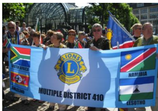
Proudly holding the MD410 banner during the Parade