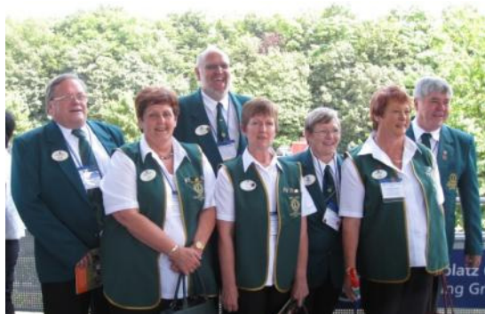
A very tired but happy bunch of Governors after Convention